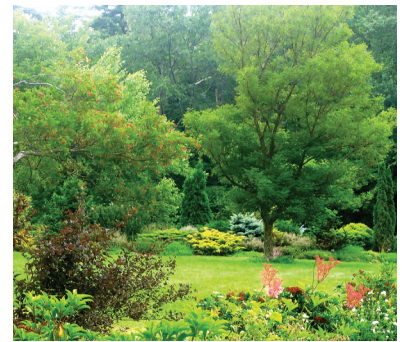
Mountain Top Arboretum

CAUTION: Outdoor recreation activities are by their very nature potentially hazardous and contain risks. All participants in such activities must assume the responsibility for their own actions and safety. The outdoors are forever changing. The Greene County Tourism Office cannot be held responsible for inaccuracies, errors or omissions, or for changes in the details in this publication or for the consequences of any reliance on the information contained herein for the safety of people in the outdoors.