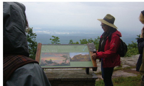
Catskill Mountain House Site – former site of America's most fashionable resort

Great hike for panoramic views of the Catskill Mountains and Hudson Valley region. Dogs are allowed off leash. Trailhead located on Big Hollow Road (County Route 56) in Windham.