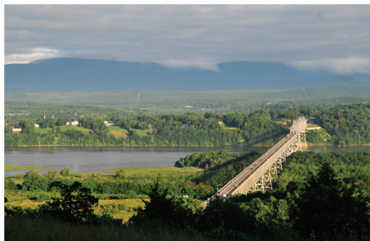
Rip Van Winkle Skywalk – Crossing over the Hudson River with views of the mountains and the Hudson River Valley