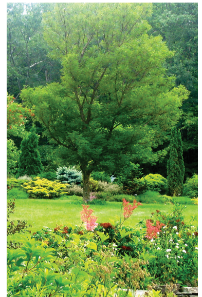
Mountain Top Arboretum

CAUTION: Outdoor recreation activities are by their very nature potentially hazardous and contain risks. All participants in such activities must assume the responsibility for their own actions and safety. The outdoors are forever changing. The Greene County Tourism Office cannot be held responsible for inaccuracies, errors or omissions, or for changes in the details in this publication or for the consequences of any reliance on the information contained herein for the safety of people in the outdoors.