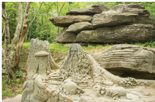
Rip Van Winkle Monument – Larger than life Blue stone carving at the top of Hunter Mountain