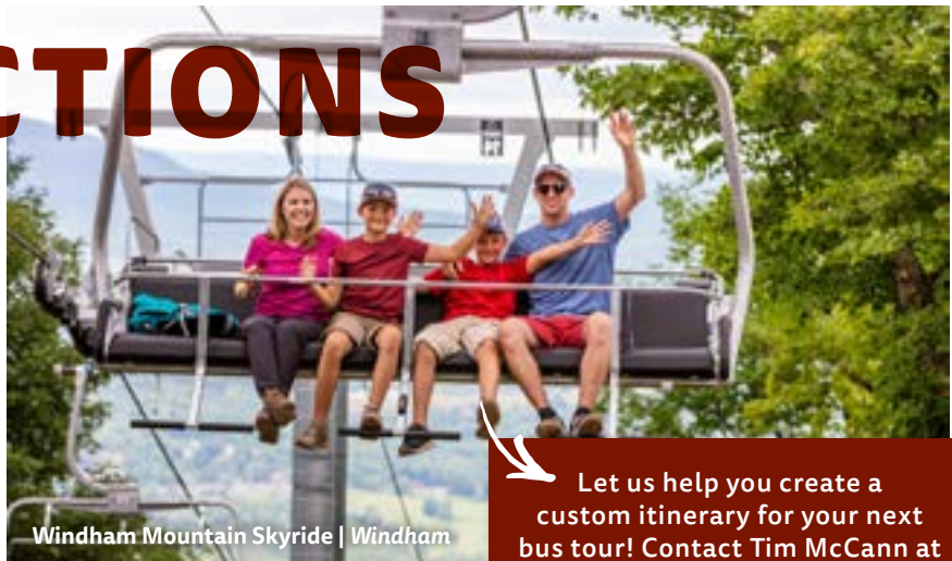
Windham Mountain Skyride | Windham

The Rip Van Winkle Bridge provides panoramic views from hundreds of feet in the air. As you look towards the mountains, see if you can identify the features of Rip Van Winkle sleeping. The walkway is 2 miles round trip.